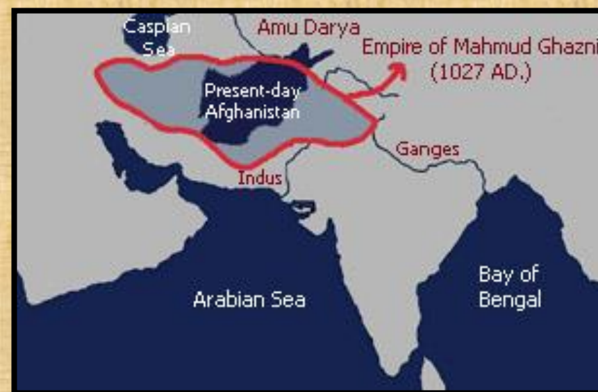
GHAZNI'S KINGDOM