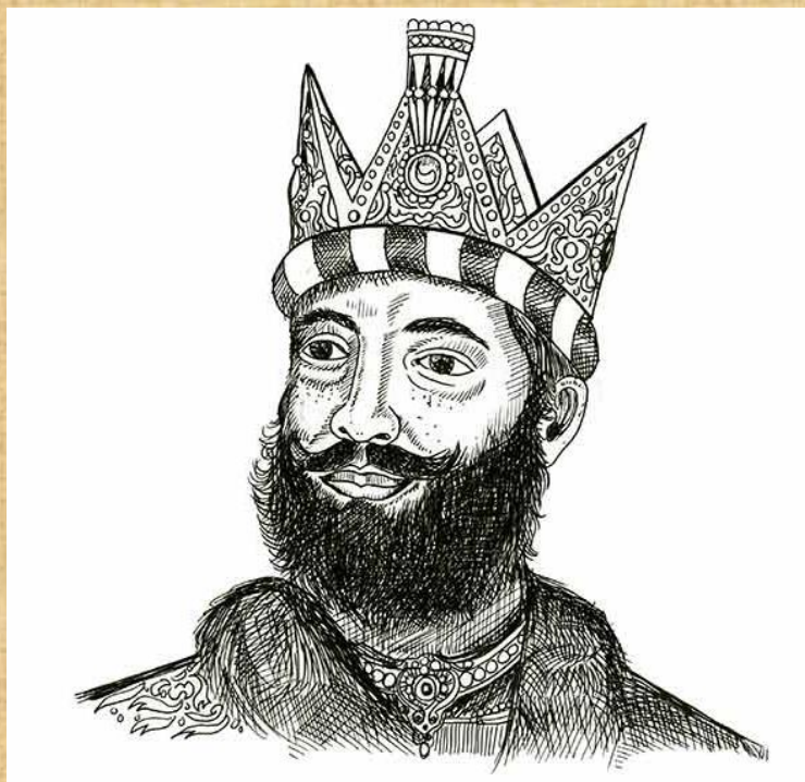
MAHMUD OF GHAZNI